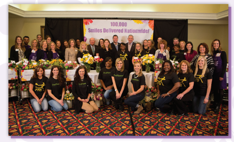
RAF Chicago and FTD prepare to deliver the 100,000th RAF bouquet

Since the founding of Random Acts of Flowers in July 2008, the mission has remained simple and focused; to deliver a moment of kindness and compassion to a person in a healthcare facility. Yes, the actual delivery of a bouquet of flowers is what's "front and center," but the RAF mission is so much more. We believe that the quality of our community's emotional and physical health can be improved one smile at a time. Medical studies have proven what we have all known – that a person's emotional state often correlates to their physical wellbeing. Happiness and healthiness go hand-in-hand and Random Acts of Flowers is proud to be a part of building better, healthier communities.